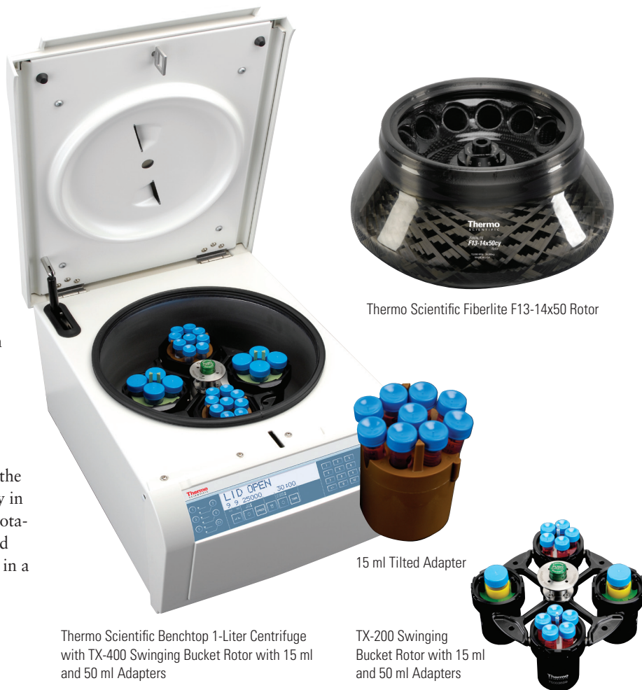
Thermo Scientific Benchtop 1-Liter Centrifuge with TX-400 Swinging Bucket Rotor with 15 ml and 50 ml Adapters

In a fixed angle rotor, as seen from the top, the tube cavities are aligned to the radial distribution of the relative centrifugal force (RCF). But due to the fixed angle configuration, the tube is not subjected to the RCF along a direct top-bottom direction. Alternatively, buckets in a swing-out rotor, apart from greater versatility, generally facilitate more favorable alignment. The buckets swing out to perfectly align with the centrifugal force (Figure 2).